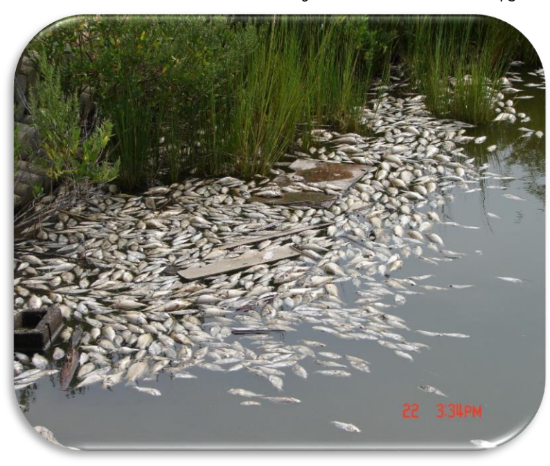
The picture above shows a fish kill where hundreds of fish die due to lack of dissolved oxygen in the water.

Cold water can hold more dissolved oxygen than warm water can. That said, dissolved oxygen levels are related to water temperature. Measurements that show high water temperature or low dissolved oxygen are indicators of an unhealthy water system. As water temperatures increase, the